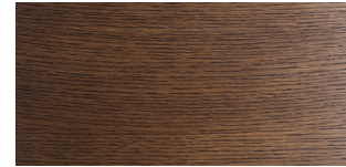
DARK STAINED OAK