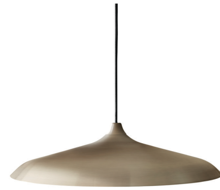
Brushed Bronze 1680869