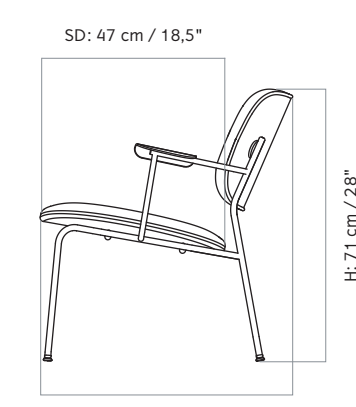
D: 66 cm / 26"

MENU - PRODUCT SHEET MENU - PRODUCT SHEET