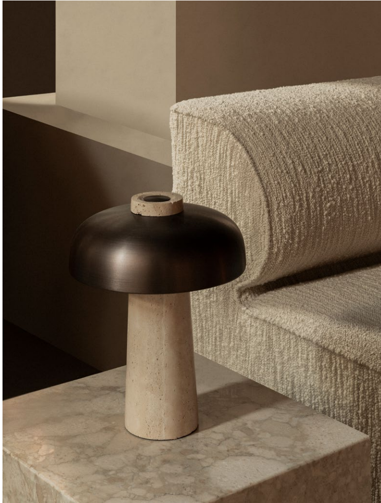
REVERSE TABLE LAMP Designed by Aleksandar Lazic