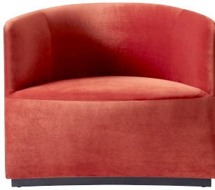
City Velvet CA7832/062